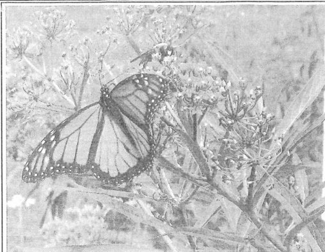
Pictured are pollinators visiting the Community Garden at St. Mark, part of what the church called its “commitment to care for creation.”